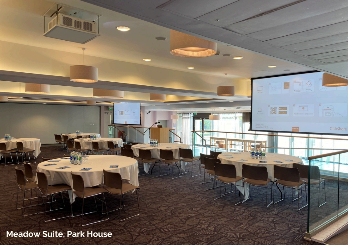
Meadow Suite, Park House